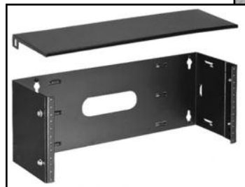
HPM shown with optional top cover